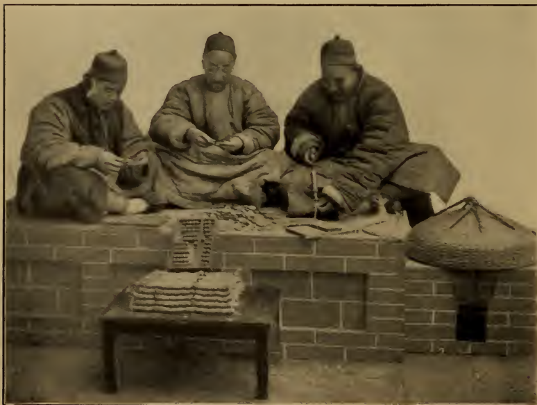
PREPARING THE STRINGS.